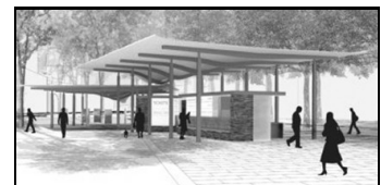
Plans by Architects Reed Hilderbrand

"The first building on the Rose Kennedy Greenway will open in 2011 – the new Boston Harbor Islands Pavilion. Architects Utile, Inc. and landscape architects Reed Hilderbrand have designed a cutting edge Pavilion that will include green technology, outdoor exhibits, and a granite map of the 34 islands. The facility will be constructed by Turner Special Projects.