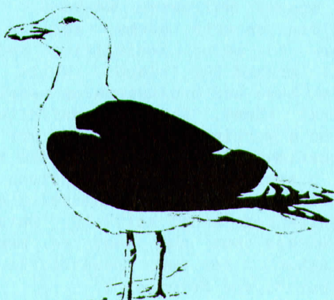
GREATER BLACK-BACKED GULL