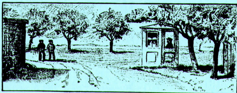
Scene at Deer Island.

Here is your chance to explore Fort Dawes on Deer Island. We will meet at the Prison Gate on Saturday, October 10, 1987, and all go in together at 11:00 AM. Bring a picnic lunch and comfortable clothes. We will be leaving at 3:00 PM. Bring your camera and get a different view of the harbor. We will meet people at Orient Heights at 10:30 A.M. Please call and let us know if you are coming, 523-8386.