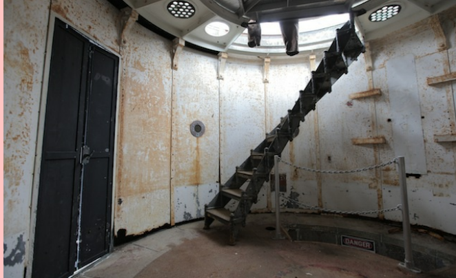
Interior of Graves Light.

To quote from a poem by Henry J. Clark published in the Boston Globe of Sept. 1, 1905, upon the completion of the lighthouse: