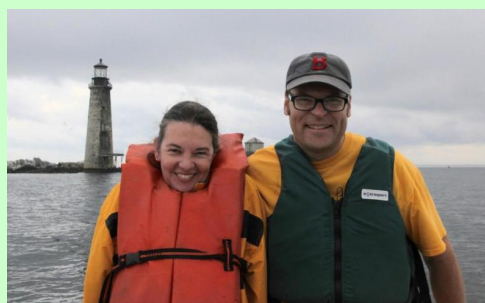
The Wallers and Graves Light

Photos, taken by Dave Waller of the seldom seen interior levels of the lighthouse station, are on this page, plus you can see more on the keeper's blog .