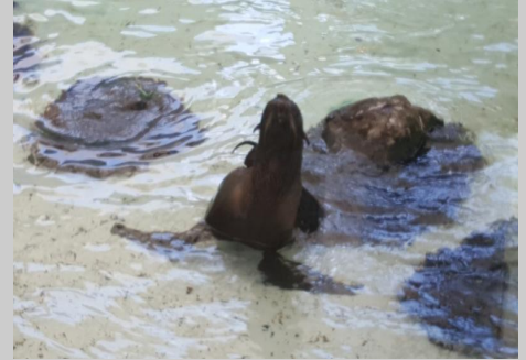
A Fur Seal

A special "thanks" and recognition to the following FBHI volunteers for their exemplary service on the islands in 2015.