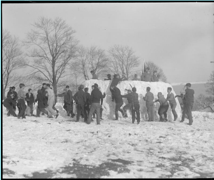
Snow Ball Battle Historic Farm School, Thompson Island

Get outside and enjoy nature on Thompson Island with its meadows, forests, beaches and 40 acres of salt marsh.