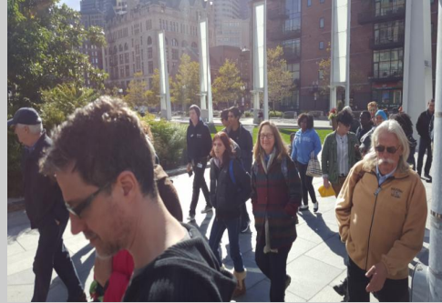
Volunteers walking to the Aquarium