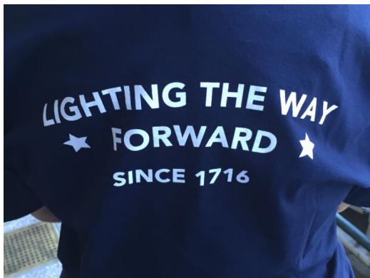
Back of the shirt