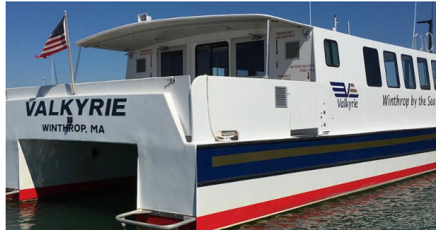
M/V Valkyrie - Winthrop's new commuter boat, now operating from Marina Bay, Quincy to Rowes Wharf & Spectacle Island as well as Winthrop!

NEW FERRY SERVICE from Marina Bay, Quincy to Spectacle Island, Winthrop & Rowes Wharf onboard the M/V Valkaree! SCHEDULE CLICK HERE. (FBHI membership discount does not apply to this service)