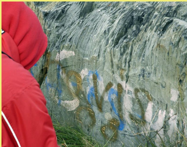
Photo documentation of historic and contemporary inscriptions and painted graffiti on Rainsford Island; pilot removal of contemporary graffiti imposed on top of historic inscriptions.