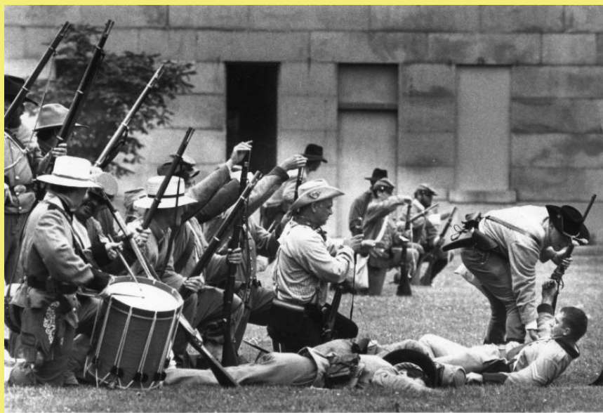
A Civil War re-enactment on Georges Island from the previous decade.

In terms of public programming, this summer we expect to conclude a Civil War education initiative that was launched several years ago, plan and pilot health and wellness activities with area youth groups, and expand our menu of theme-based tours and recreational experiences. We will continue to support TIOBEC teaching and learning initiatives, and will be working to refine the curriculum that supports our summer youth work programs. In addition, we will be installing and evaluating temporary exhibit panels at the Welcome Center as part of an effort to provide passersby with an experience that incites them to visit the islands.