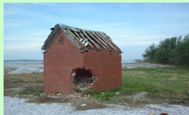
The oil shed as it used to be

In this edition of Tidings you'll see that the boat trip schedule is complete. Thank you Suzanne for your hard work scheduling the trips and boat contractors (not an easy task), and for arranging a trip to Thompsons Island this year! All of the trips tickets can be purchased online at Brown Paper Tickets by going to the