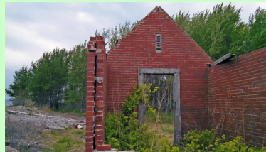
The Lovells oil shed is slowly falling into pieces.

We were also saddened to see the state of the brick oil building on the North End of the island; a wall has collapsed and roof has fallen in. One of my photos shows the building in 2006 with the roof in disrepair and a hole in the wall. Could we - the FBHI work with the NPS and DCR to bring this small reminder of the islands past back - before it is gone?