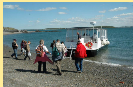
Catching the boat on Rainsford Island

October 11 Rainsford, 10 a.m. to 2:00 p.m. Island Expeditions with Rowes Wharf Water Transport