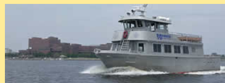
Take a lighthouse tour with UMass Boston Marine Operations

Boston Light, Graves Light and Fog Station, Long Island Light and Nixes Mate from on board the MV Columbia Point.