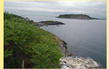
The view from Calf Island toward Great Brewster.

July 9 Long Island sunset, 6 to 9 p.m. Leave from Rows Wharf Water Transport, Boston.