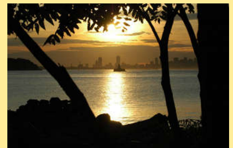
Take a sunset boat ride on June 25, July 9, July 23 and Aug. 20 and see the harbor islands in a new light.

June 22 Great Brewster, noon-5:00p.m. Leave from Rowes Wharf Water Transport, Boston.