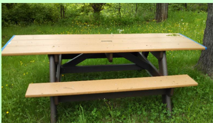
The Pearl Lang table and inscription.

June 25 Lovell sunset, 6 to 9 p.m. Leave from Rows Wharf Water Transport, Boston.