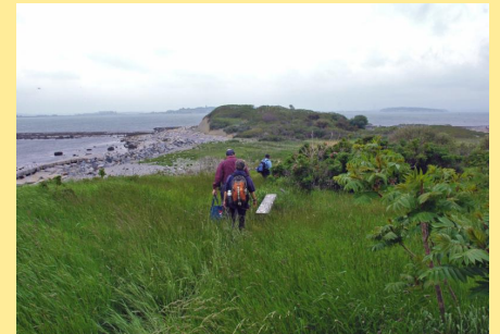
Visit Great Brewster Island June 22 and Sept. 20