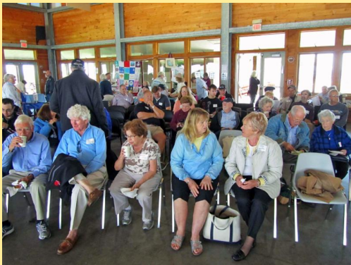
Friends met friends at the annual meeting