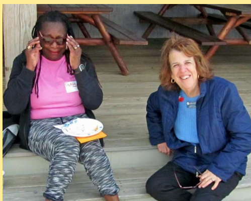
"Picnic on the Porch"