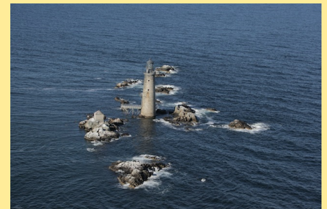
See Graves Light on July 18, Aug. 8 and Sept. 12 with a lighthouse tour.

August 6 Mystery Island sunset: Details to come