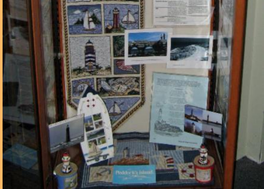
Chatham Library Display on the Harbor Islands by Kevin Rogers

Please contact me at kevinsouthshore@gmail.com