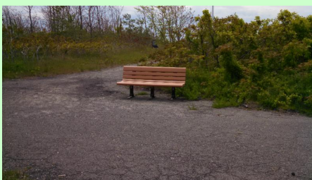
The inscription and bench dedicated to John Forbes