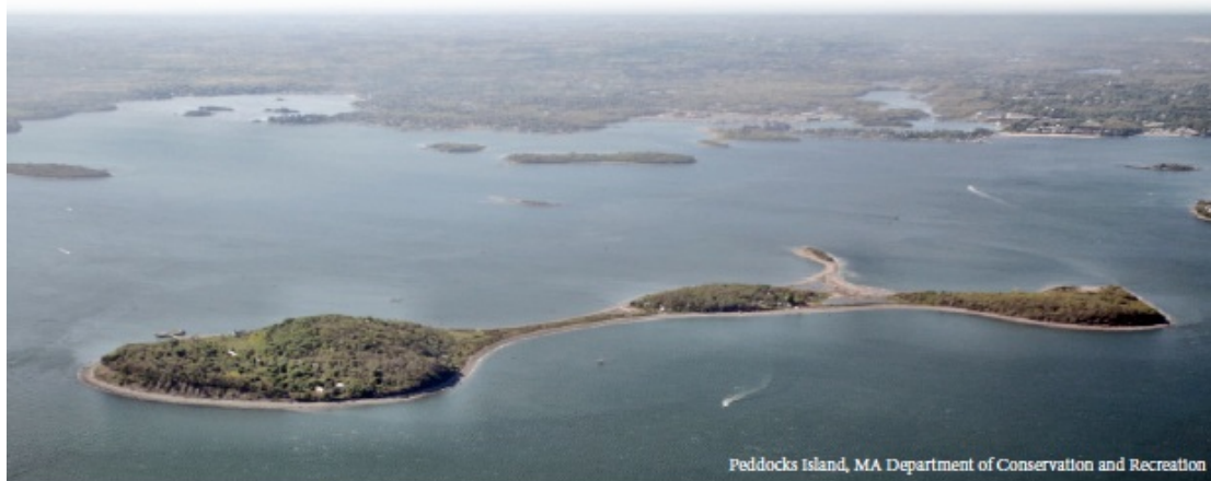
Peddocks Island, MA Department of Conservation and Recreation